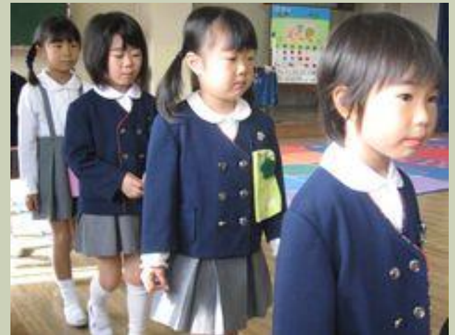
Students in Japan wear uniforms.