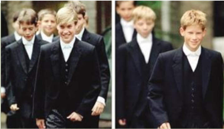
Prince William and Prince Harry