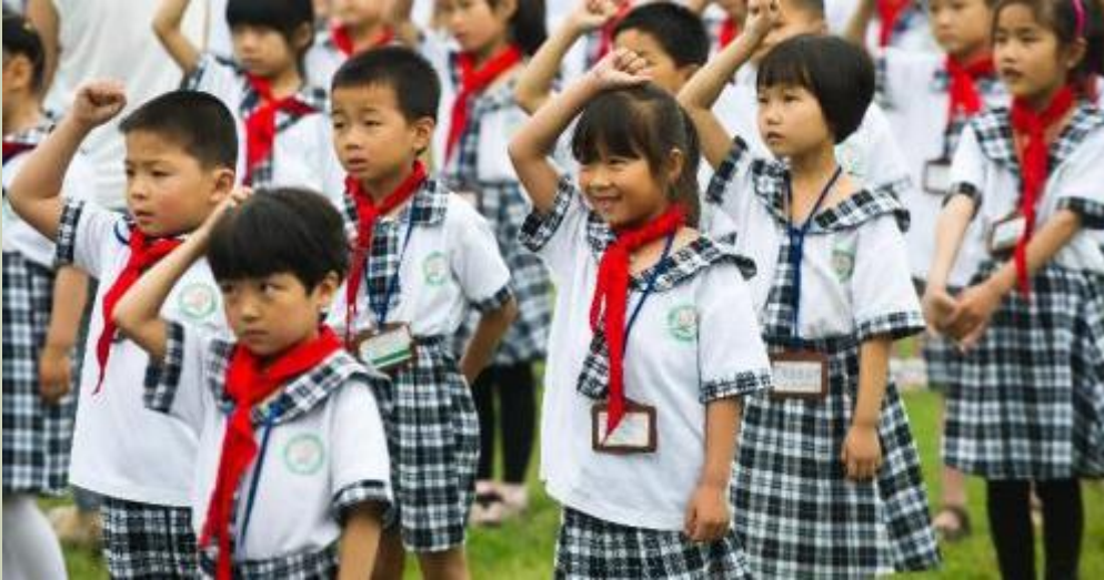
Students in China wear uniforms.