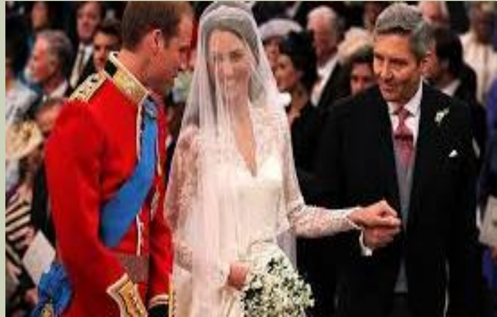
Prince William and Duchess Kate