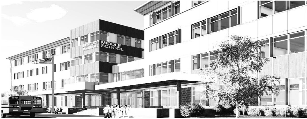
Figure 1 | Picture of Our School