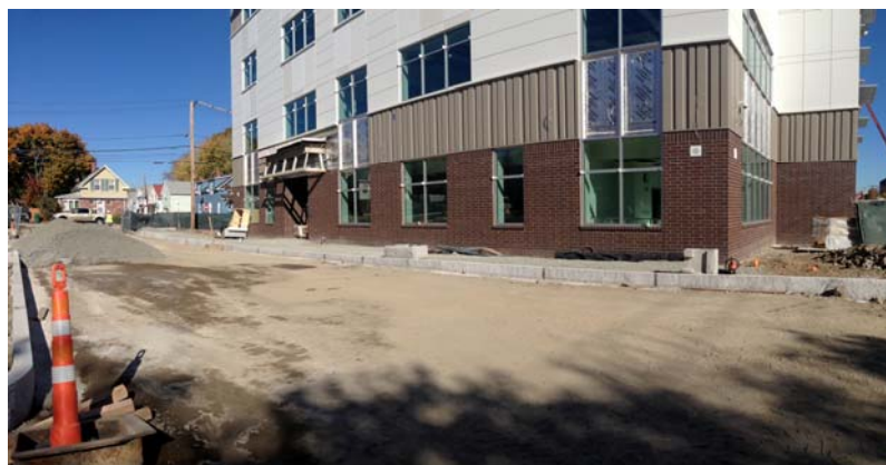
Status of Exterior and Interior Construction