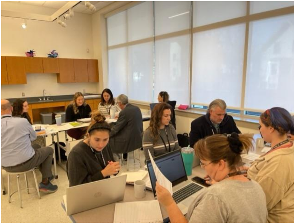
Staff Enjoying the PTO Mustang Mugs