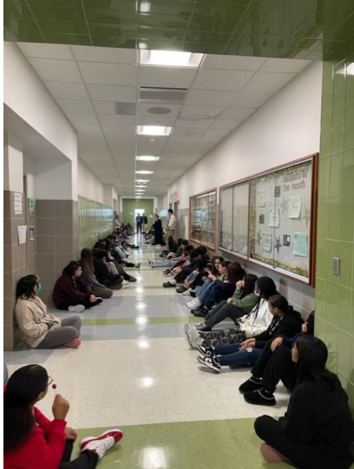
Our Clinician Team training our staff in de-escalation techniques