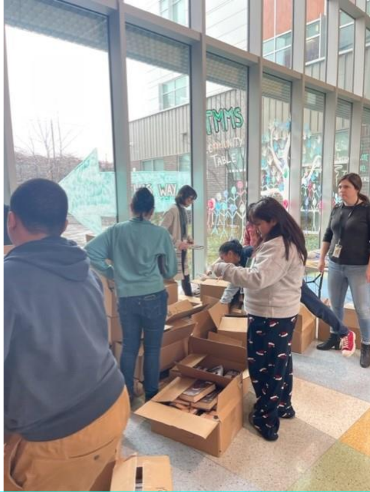
TMMS Drama Club Gearing Up for their Feb 16 th Performance of The Cinderella Chronicles