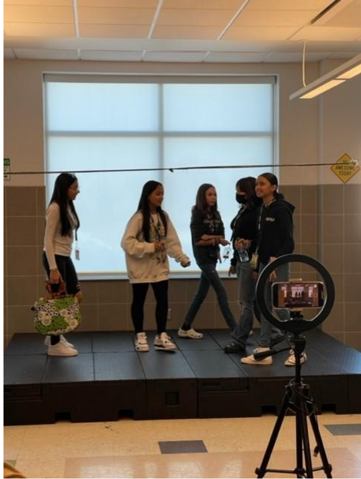
SCENES from the SCHOOL