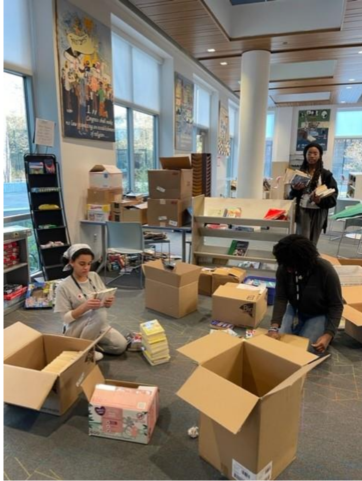
SEL Team Passing Out Turkey Meals