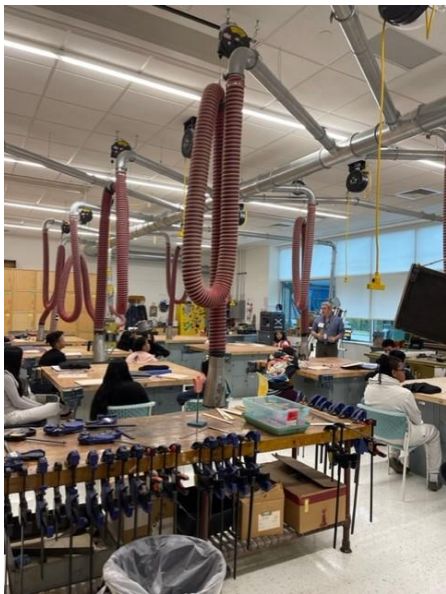
Students creating in our Manufacturing Class