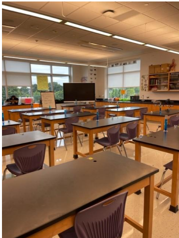
Grade 07 Science Lab Ready to Explore Water Levels on Earth