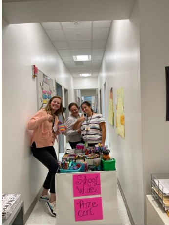
Our Clinicians getting their prize cart ready to roll