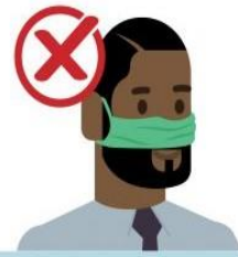
Only on your nose