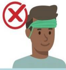
On your forehead