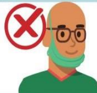
On your chin