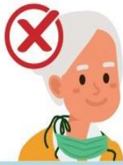
Around your neck