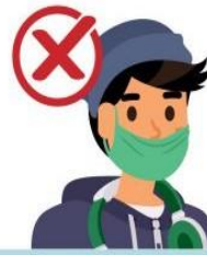
Under your nose