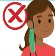
Dangling from one ear