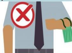
On your arm

PLEASE NOTE: Masks should NOT be worn by children younger than two, people who have trouble breathing, or people who cannot remove the mask without assistance. Please contact your principal or school nurse if you are unable to wear a mask due to these reasons.